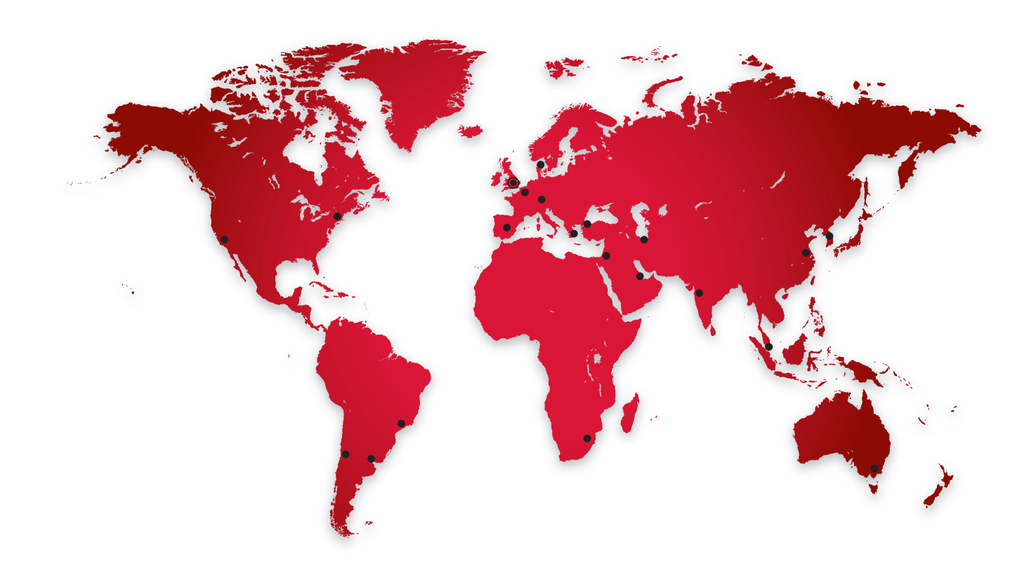
Asia • Europe • Middle East • Americas • Oceania • Africa